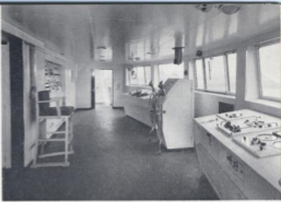
Above: THE WHEELHOUSE