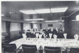
Below: THE OFFICERS' DINING ROOM