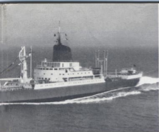
POWERFUL DIESEL CARGO LINER